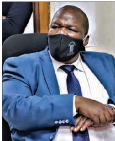
Mayor Mzimkhulu Thebolla and MEC Ravi Pillay

"We understand that the country is on lockdown because of Covid-19 as a result the number of people working has been reduced in order to be able to practise social distancing but a unit as critical as this one must have a proper way of working. I'm going to request