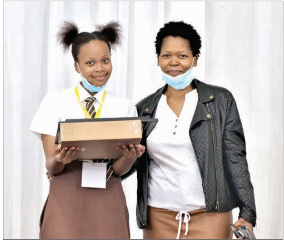
Msunduzi Pride: Students who excelled in the 2020 matric exams