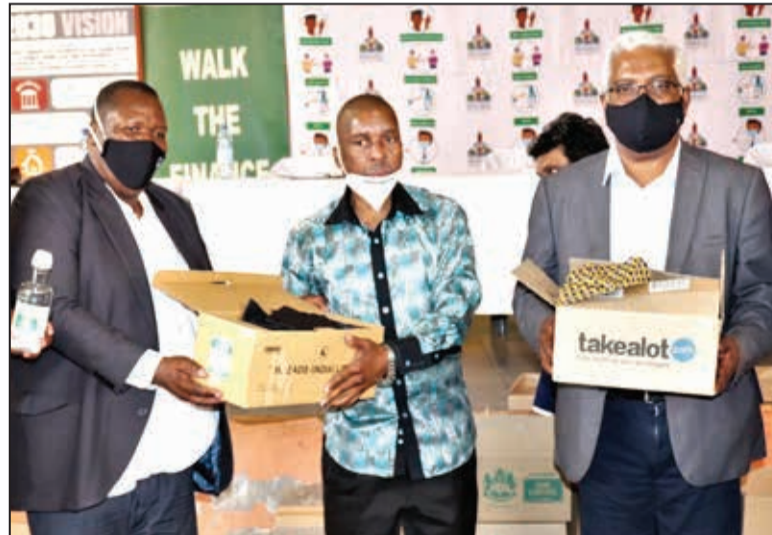
Mayor Thebolla and MEC Pillay presenting PPE donation

He then addressed the Council on how the Provincial Treasury works saying their responsibility is to ensure that government funds are used properly.