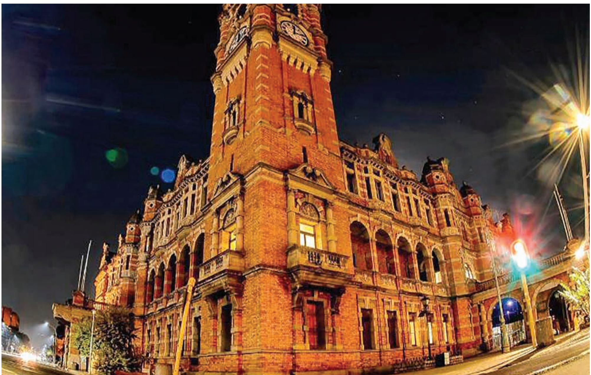
PROVINCIAL CAPTIAL: Msunduzi's City Hall