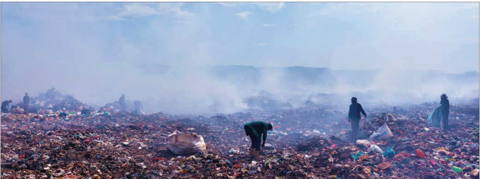
England Landfill Site is plagued by a number of problems.